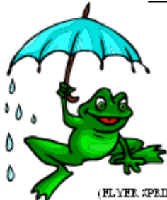
(FLYER SPRING 10A/SPFY10)

PAYMENT ENCLOSED: $ _____ (If registering by fax or Email please mail payment or Pay with credit by phone @ (360) 377-3741)